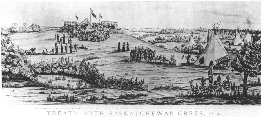
FIG. 1. Treaty with Saskatchewan Crees, 1876.